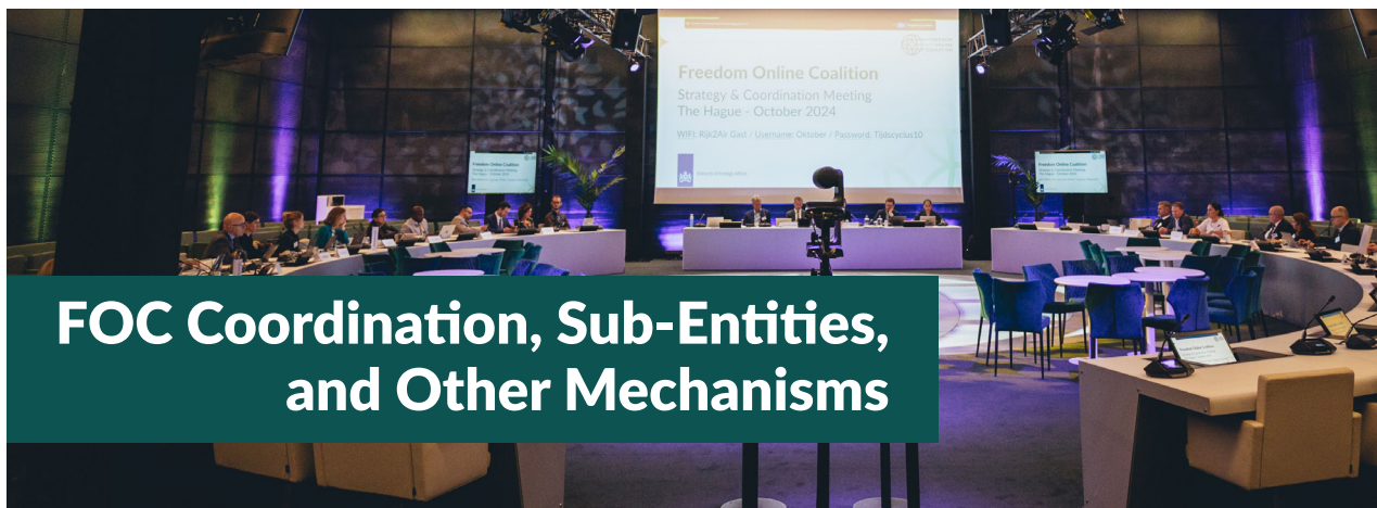
FOC and FOC-AN Members convening as part of the Strategy & Coordination Meeting hosted in The Hague.

The FOC's advocacy efforts, including through outputs, events, and submissions to multilateral processes, were coordinated through the Coalition's internal mechanisms as outlined in the ToR. These mechanisms facilitate information and knowledge sharing amongst a broad range of stakeholders including representatives from government, civil society, academia, the technical community, and the private sector.