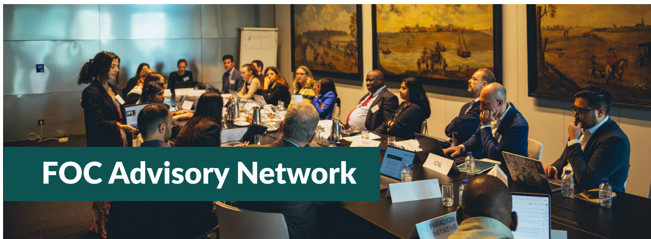
FOC-AN Members convening as part of the Strategy & Coordination Meeting hosted in The Hague.

As the Coalition's key mechanism for multistakeholder engagement and dialogue, the Advisory Network (FOC-AN) continued to provide FOC Members invaluable advice on issues and developments in the Internet and digital technology space. Members of the Advisory Network were instrumental in supporting Coalition activities to collaboratively advance a human rights-based and multistakeholder approach to the governance of the Internet and artificial intelligence technologies, and address ongoing challenges to Internet freedom. To enable meaningful engagement on priority issues and in relevant processes, the Advisory Network also shared their expertise in internal settings in order to build FOC Members' capacity and knowledge, and represented the network in external events.