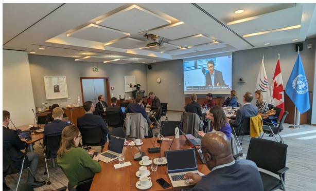
FOC Geneva Diplomatic Network representatives and members of the FOC Advisory Network during a multistakeholder workshop on the Global Digital Compact in Geneva.

Internet and digital technology governance ahead of and in the negotiation processes. Ahead of the UN Human Rights Council sessions, the network met to share insights and information, facilitate capacity building for FOC Member States on specific issue areas with the FOC Advisory Network, and exchange FOC language proposals. The network also facilitated discussions on the human rights impact of the use of ICTs and AI in the military and humanitarian context, and exchanged information around the Universal Periodic Review (UPR) to assist Member States participating in the process. Throughout all of these activities, the network continuously facilitated dialogue and collaboration with relevant stakeholders, including UN secretariats and agencies whose work focuses on the impact of digital technologies on human rights, such as the Office of the UN High Commissioner for Human Rights (OHCHR), the UN Office of the Secretary-General's Envoy on Technology, and the International Telecommunications Union (ITU). FOC Geneva network representatives also played an active role in the FOC Strategy and Coordination Meeting held in Geneva in May 2024, and contributed to various capital-led discussions.