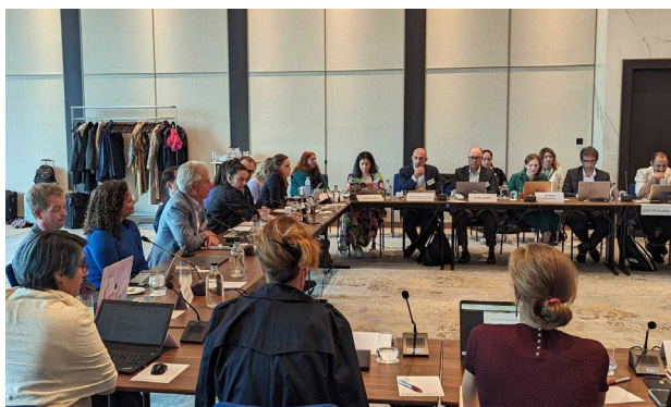
FOC Member State representatives and FOC Advisory Network Members during the first Strategy & Coordination Meeting of 2024 in Geneva.

In May on the margins of the WSIS+20 High-Level Forum, FOC stakeholders convened in Geneva for the first Strategy & Coordination Meeting (SCM) of the Netherlands' Chairship. The meeting provided an opportunity for both capital and diplomatic network focal points to explore proposals for FOC engagement in the UN GDC and the Pact for the Future, including key opportunities, challenges, and concerns relating to the negotiations. The Advisory Network facilitated a capacity building session on the WSIS process, including the history, key themes and stakeholders, and what is at stake in the upcoming WSIS+20 review. Member States, Observers, and the Advisory Network participated in a Joint Roundtable discussion which focused on topics including the GDC, engagement in the 2024 IGF, and advancing diversity, equity, inclusion, and accessibility (DEIA) within the Coalition. The meeting concluded with an opportunity to look ahead at the remainder of 2024, and to hear from the Coalition's active sub-entities on their information sharing and coordination efforts relating to Internet shutdowns, AI, and Information Integrity.