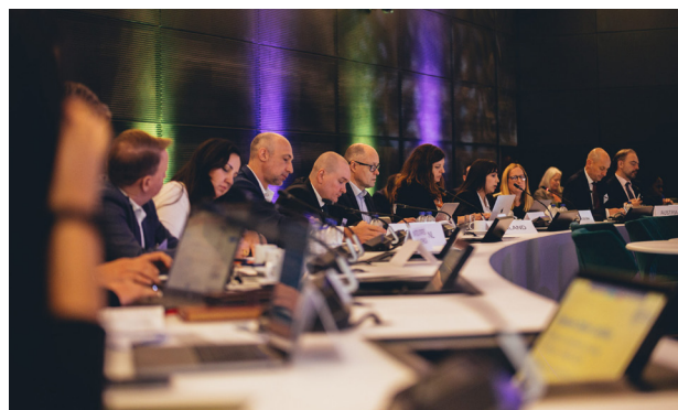
FOC Member State representatives and FOC Advisory Network members during the second Strategy & Coordination Meeting of 2024 in The Hague.