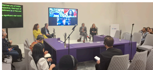
Panelists during the Task Force on Internet Shutdowns' Day Zero session as part of the 2024 Internet Governance Forum in Riyadh.