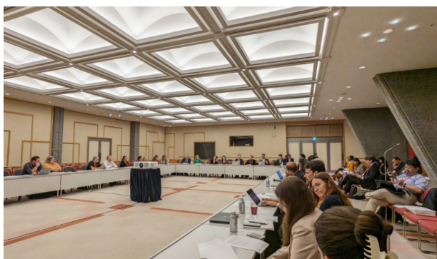
Participants at the 2023 Global IGF session "Donor Principles for Human Rights in the Digital Age: Turning Principles into Action", in Kyoto, Japan.

The FOC published the "Donor Principles for Human Rights in the Digital Age" during a hybrid launch-event at the 2023 Internet Governance Forum in Kyoto, Japan. The Donor Principles call on governments with international development and assistance programming to advance an affirmative, rights-respecting agenda to promote a digital future that upholds the commitment to 'do no harm.' They are driven by the ideal that donors should invest in digital technologies and data collection only when it is possible to protect against their potential misuse, and when procedures are put in place to facilitate this protection. The development of the principles was led by the co-Chairs of the FOC FCG, with input from the Coalition's Member States, the Advisory Network, and external stakeholders via a public consultation, facilitated by the SU.