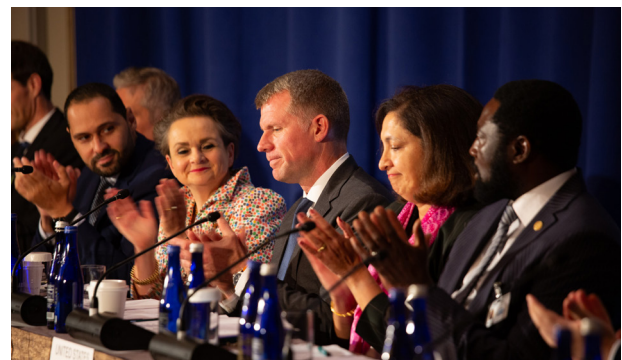
High-level representatives of FOC Member States, key G77 partners on technology policy, and other stakeholders including from the FOC's Advisory Network attending the FOC side-event on the margins of the 78th session of the UN General Assembly in New York.