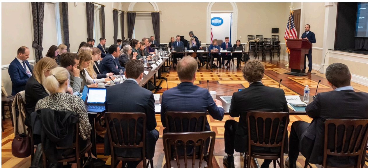
FOC Member States convening as part of the Strategy & Coordination Meeting hosted in Washington, D.C.

In November, FOC Members, alongside the Coalition's multistakeholder Advisory Network, Observers, and representatives from the FOC Geneva diplomatic network, convened in Switzerland to reflect on the work of the Coalition's various mechanisms during the 2023 U.S. Chairship, as well as to discuss the 2024 PoA and specific activities under the upcoming Dutch Chairship. FOC Members also engaged in a Joint Roundtable with civil society, academia, and private sector representatives from the Advisory Network to explore strategies for FOC engagement in the Global Digital Compact (GDC) process and the World Summit on the Information Society Review Process (WSIS+20). In addition, TFAIR organised an interactive workshop on AI, giving participants the opportunity to build their capacity and knowledge on the topic. The FOC also heard from the Geneva Science and Diplomacy Anticipator (GESDA) and the Office of the United Nations High Commissioner for Human Rights (OHCHR) B-Tech Project on future development of AI and B-Tech's Generative AI project.