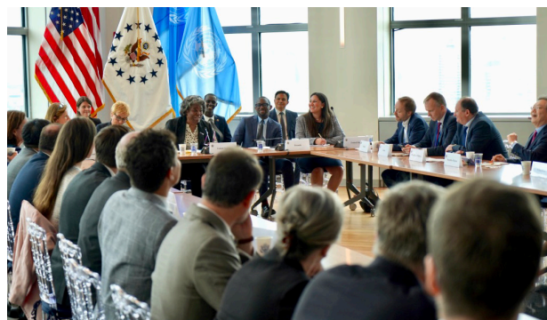
U.S. Ambassador Linda Thomas-Greenfield welcoming participants from FOC Member States' Missions in New York, and other key partners to the NY diplomatic network kick-off meeting.

co-facilitators of the intergovernmental process, Sweden and Rwanda. The U.S. also hosted a working-level meeting in the network for FOC Member States' representatives participating in the AHC Cybercrime Convention negotiations, which featured a presentation by the FOC Advisory Network on their Proactive Advice on the Zero Draft of the Convention. The network also participated in the September FOC-wide briefing by the FOC Advisory Network on their recommendations regarding the GDC process and substance.