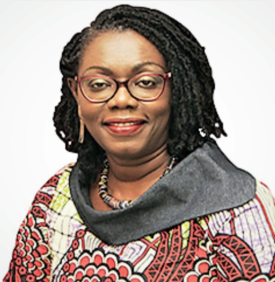
Minister of Communications, Mrs. Ursula Owusu-Ekuful

Ghana’s role as Chair of the Coalition and subsequent host of the 8th Annual Freedom Online